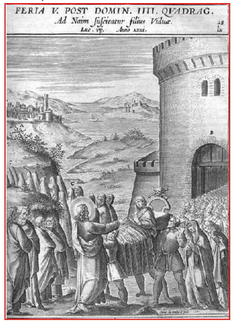
From "Illustrations of the Gospel Stories" by Jerome Nadal: Luke 7:11-17 The son of the widow is raised at Nain by Jesus .

Our Savior & Peace Lutheran of Lakeland 16<sup>th</sup> Sunday after Trinity k (Death) Dying & Rising September 20<sup>th</sup>, 2015 k 9:30am & 11am